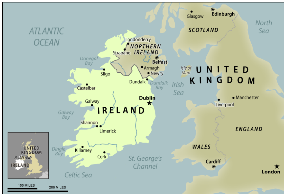
Figure 2. Map of Northern Ireland (UK) and the Republic of Ireland