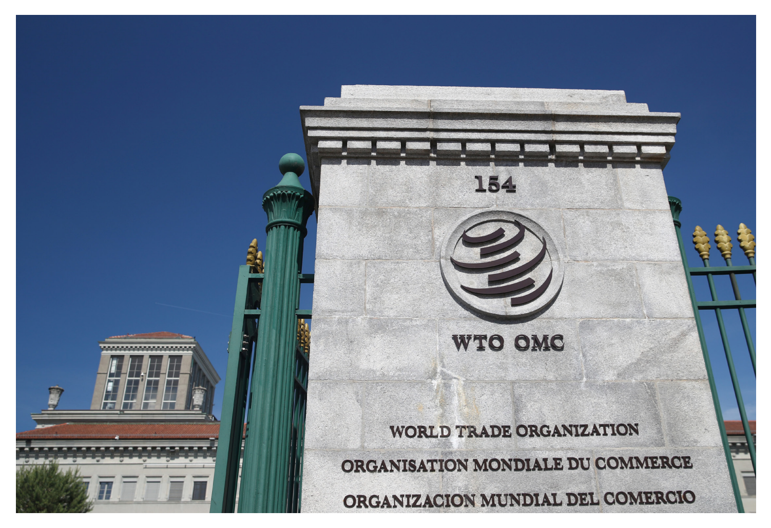
A logo is pictured on the headquarters of the World Trade Organization (WTO) in Geneva, Switzerland, June 2, 2020.

more diverse and resilient supply chains, in order to better anticipate potential future pandemics. In that respect, the EU invites the US to take part in the Trade and Health Initiative.<sup>51</sup>