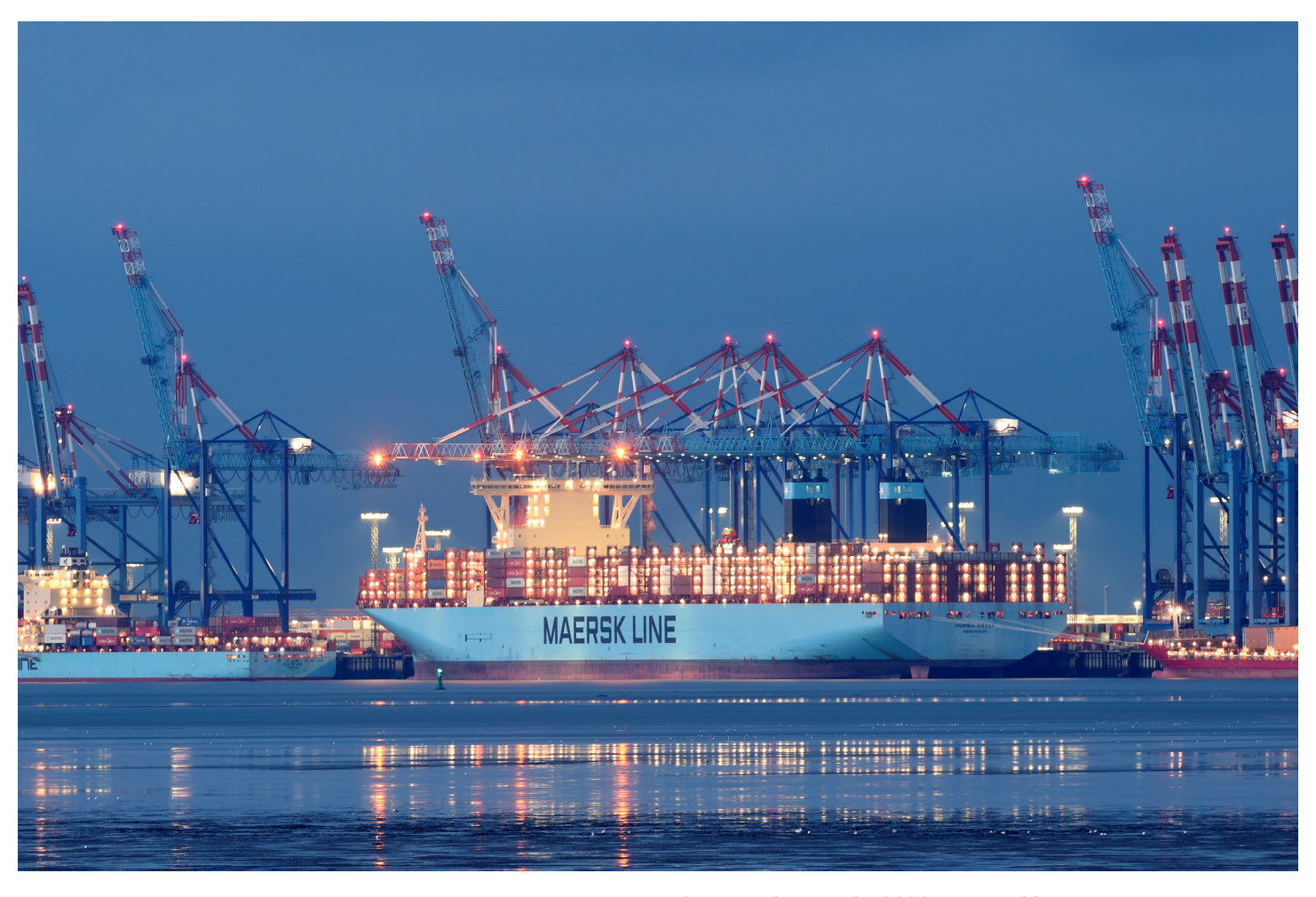
Maersk container ship is loaded at a harbour terminal in Bremerhaven, Germany October 31, 2020.

reductions in duties in more than two decades, with the elimination of European tariffs on imports of US live and frozen lobster products, in exchange for the reduction of US tariffs on a range of European products, including glassware, ceramics, and disposable lighters. In commercial terms, the agreement is small and narrow. However, given its focus on symbolic US products, it is better understood as a sign of the EU's will to build a positive trade agenda.