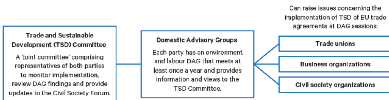
Figure 1. A bird's eye view of the regular consultative arrangements and bodies established under the trade and sustainable development chapters of EU FTAs (excluding ad hoc dialogue and dispute resolution processes)

input into monitoring processes by affected stakeholders and their representatives seems well recognized, at least as a matter of principle. 30 The structure devised for EU FTAs, comprising of locally constituted Domestic Advisory Groups (DAGs) that feed information and views into joint mechanisms (e.g. committees) provided for in the trade agreement, is intended to facilitate this input (see Figure 1 below). EU FTAs also provide for an annual joint Civil Society Forum, which can be attended by stakeholders who do not participate in the DAGs, as well as by DAG members.